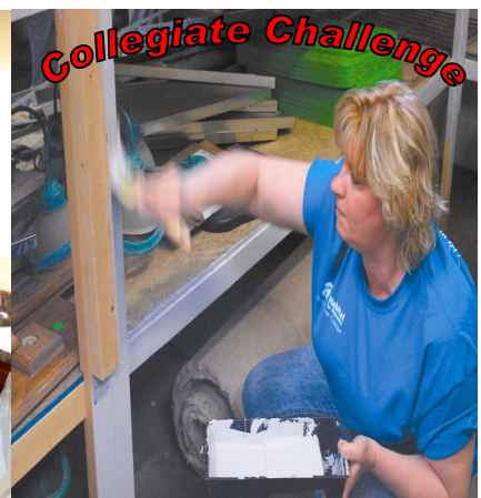
Collegiate Challenge Spoon River College came to assist with our ReStore renovations as part of the Collegiate Challenge. They resided at Peace Lutheran Church. Thank you to Peace Lutheran for your assistance. Thank you Spoon River for helping make our store look great!